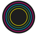
BUILDING BEATS www.buildingbeats.org